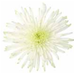
Anastasia Star Mint