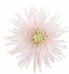
Anastasia Star Pink